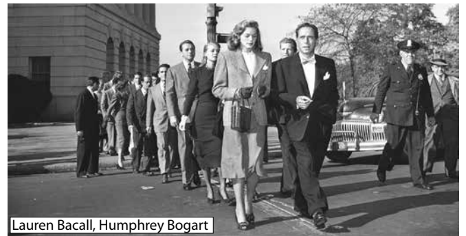
Lauren Bacall, Humphrey Bogart