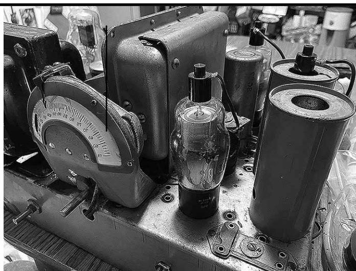
One can only fantasize what programs passed through the tubes of this 1931 radio chassis currently being restored in our office.