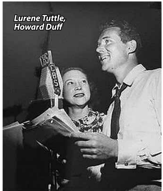
Lurene Tuttle, Howard Duff